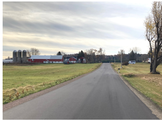
Schultz Road repaved in 2021