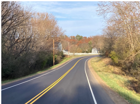
S. Lowes Creek Road repaved in 2021