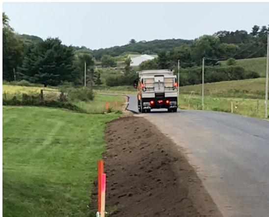
Shouldering of newly paved Mueller Road