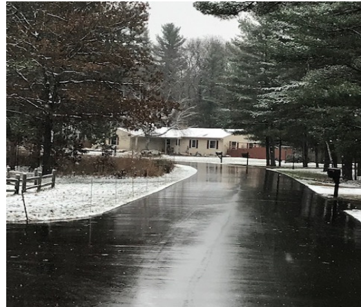
Repaved Corydon Road