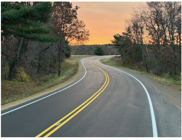
New Hobbs Road